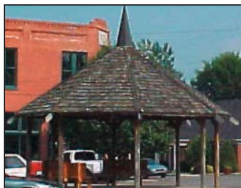
Gazebo - 2002

The next steps will be a new cupola, interior lighting and a ceiling fan, all scheduled to be completed this summer.