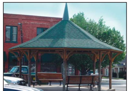
Gazebo - 2007